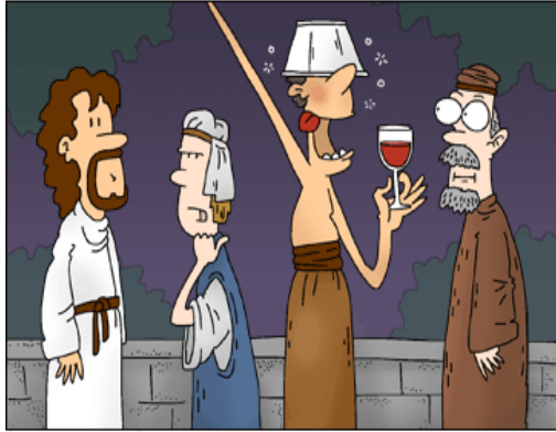
(See John 2:1-11) 05-25-2015 WOULD IT BE POSSIBLE TO TURN WINE BACK TO WATER?